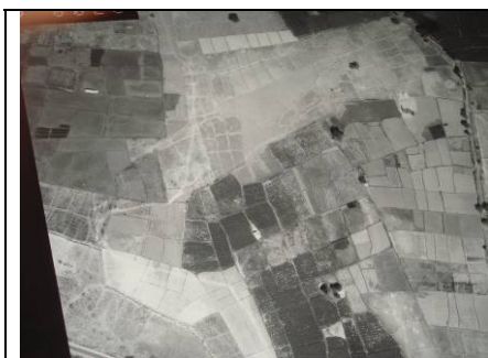
Bromide Map through Arial Survey

A team consisting of technical members from the Director of Land Records, OCAC, ORSAC, OUAT and OTELP visited to Andhra Pradesh to be exposed to the DGPS and ETS method adopted for survey and settlement of land in Nizamabad district, Telengana region of Andhra Pradesh. The exposure has capacitated the members to understand the technology and the best suitable method than can be piloted in OTELP programme areas. The team observed, while undertaking the survey work, the following aspects are to be given adequate attention.