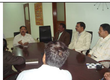
Interaction with Commissioner, Land Records and Survey